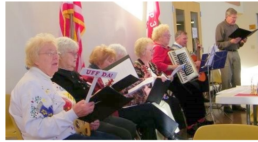
Vestafjell Uff Da Singers