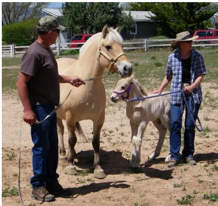
Four days old

It was a gorgeous warm day and prior to the meeting indoors, Elmer and Brandy Ferganchick introduced us to some of their Fjord horses. One of the horses was a four day old foal that was not yet named.